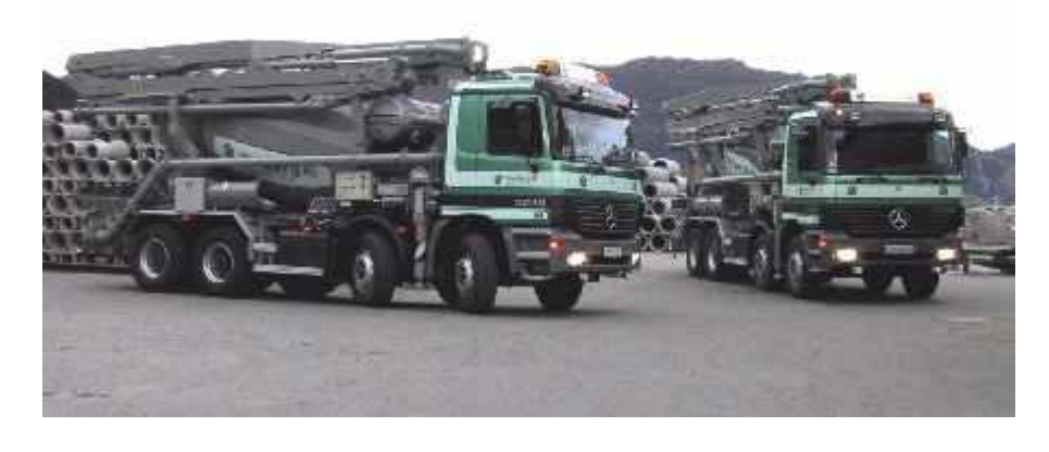
60 mill NOK invested in production fascilities and purchase of land

2011 - Ban on foreign ownership on land in border areas, - regions in Murmansk included